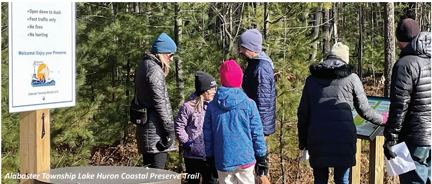
Alabaster Township Lake Huron Coastal Preserve Trail