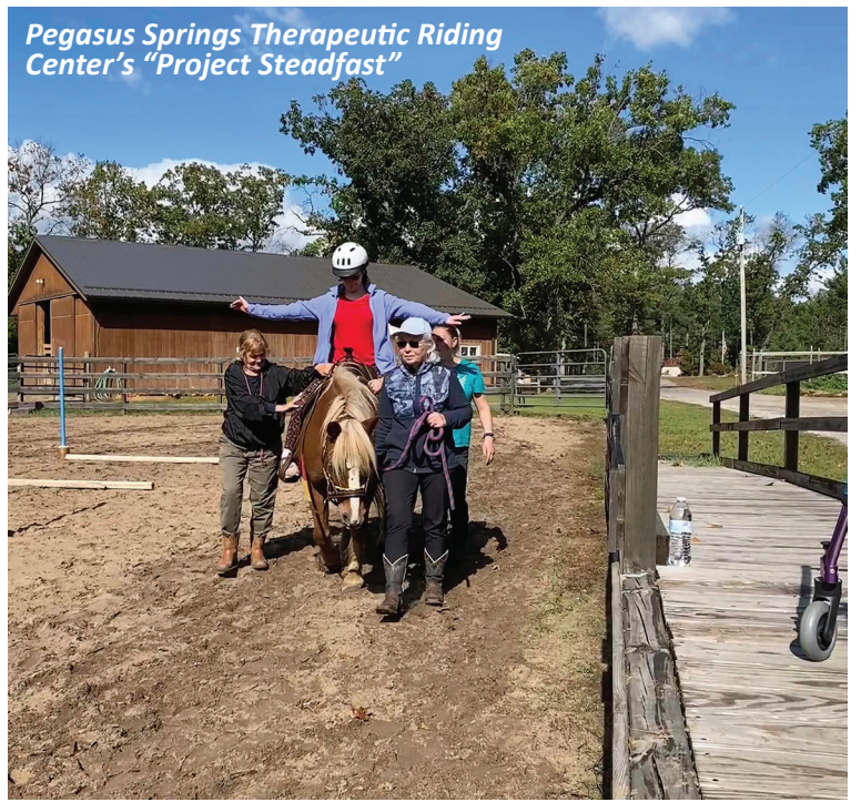
Pegasus Springs Therapeutic Riding Center's "Project Steadfast"