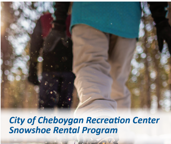
City of Cheboygan Recreation Center Snowshoe Rental Program