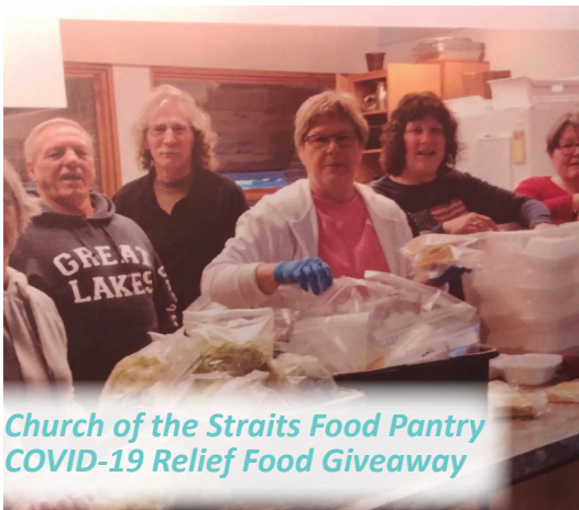
Church of the Straits Food Pantry COVID-19 Relief Food Giveaway