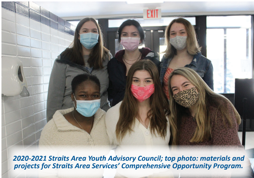
2020-2021 Straits Area Youth Advisory Council; top photo: materials and projects for Straits Area Services' Comprehensive Opportunity Program.