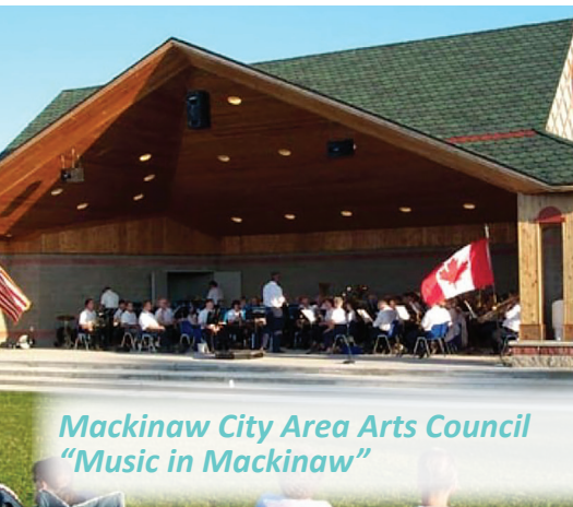
Mackinaw City Area Arts Council "Music in Mackinaw"

The Straits Area Community Foundation makes every effort to recognize our donors properly. If we have unintentionally omitted or misspelled your name, please accept our sincerest apologies and advise us of corrections to be made.