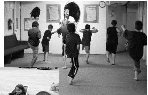
Above: YAC grants help provide new skills and adventures for area youth.