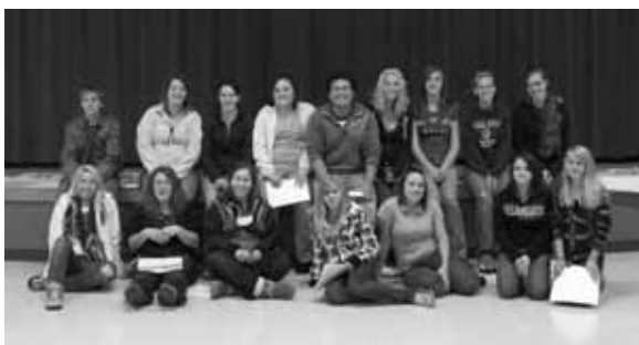
2009 Straits Area YAC

During 2009, the Straits Area YAC (SAYAC) awarded $4,077 in grants to youth programs in Cheboygan County and Mackinaw City.