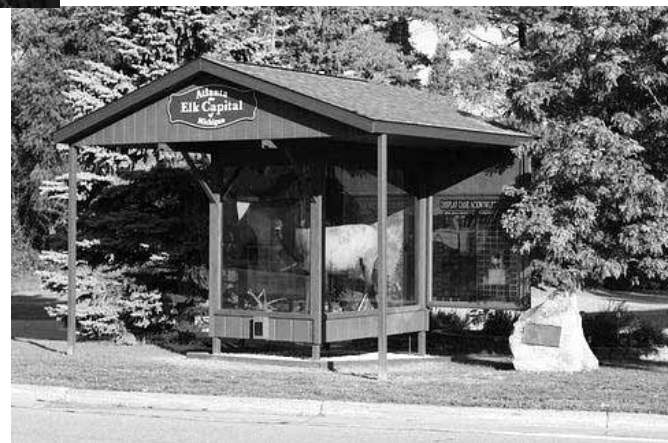
Area youth often participate in community improvement project grants. Above left: The Mural of Hope in the outdoor garden area of the Alpena Cancer Center. Right: Renovation of the Atlanta Elk display, a focus of community pride in Montmorency County for many years.