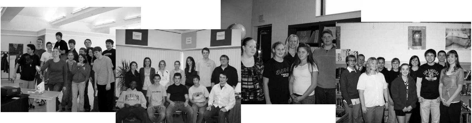
Above: YAC members from the counties of Alcona, Alpena, Montmorency, and Presque Isle meet three times each year to review grant applications.

NEMYAC is a permanent committee of the Community Foundation for Northeast Michigan (CFNEM) and is comprised of approximately 60 students and seven adult advisors from the counties of Alcona, Alpena, Montmorency, and Presque Isle. Since April of 1993, YAC members have recommended over $800,000 in grants for the four county service area. In the spring of 2010, the total number of grants submitted for review will reach 1,000. Thanks to a challenge grant from the W.K.Kellogg Foundation, CFNEM's YAC has over $1 million permanently endowed in a youth field-of-interest fund. The fund provides nearly $50,000 each year to be allocated for youth related programs and projects. After the students review grant applications and reach consensus about funding amounts, their recommendations are presented to the CFNEM Board of Trustees for final approval.