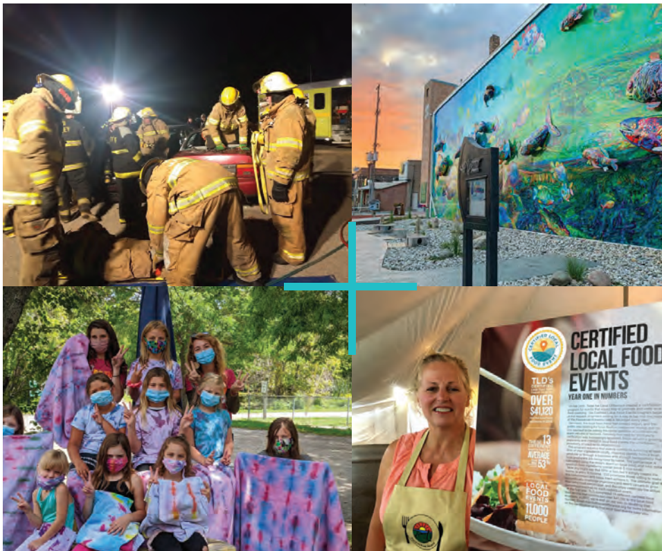
Clockwise from top left: Sanborn Township grant to purchase Jaws of Life; Downtown Alpena's Fish Mural; Inspiration Alcona grant to support the annual Small Farm Conference; Boys and Girls Club of Alpena grant for the SMART Girls program.