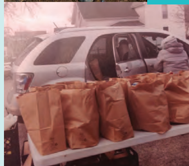
Bottom left: Church of the Straits Food Pantry drive-through food giveaway