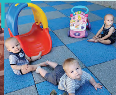
Bottom right: Alpena Childcare and Development Center infant playground