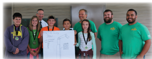
Surline Middle School students win contest for their "WormEater Waste Bin".

One seventh-grade student commented that the program "taught us to think of nature more than just a tree or leaf, but of how we can sustain ourselves through it, if we learn from it and use it to better ourselves."