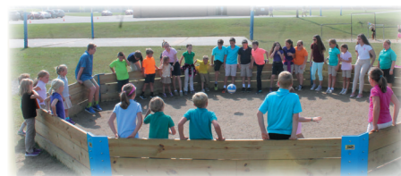
Construction of this Ga Ga Ball Pit was supported through a YAC grant to St. Joseph School from the Ogemaw County Youth Advisory Council.