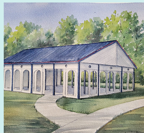
Left to right: Volunteers of Rayola, Inc. assemble care packages for foster children; the volunteer team at Pegasus Springs Therapeutic Riding Center works with a client during their summer program; a rendering of the new pavilion that will be constructed at Tawas Point State Park.