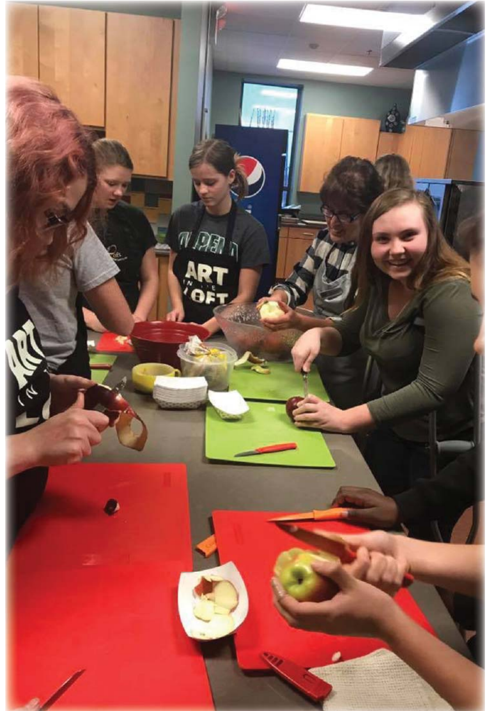
Art in the Loft hosts “Cats in the Kitchen” - a healthy cooking and eating program.

Adrian College Bois Blanc Island Community Foundation Bois Blanc Pines School Central Michigan University Cheboygan Compassionate Ministries, Inc. Cheboygan County Junior Golf Academy Foundation Cheboygan County United Way Friends of Inland Lakes Schools Friends of Ottawa Park Grand Valley State University Icebreaker Mackinaw Maritime Museum Indian River United Methodist Church Inland Lakes Schools Junior Achievement of Northern Mich. Mackinaw Area Historical Society Mackinaw Area Public Library Mackinaw City Area Arts Council Mackinaw City Chamber of Commerce, Inc. Mackinaw City Schools McLaren Northern MI Foundation Michigan State University