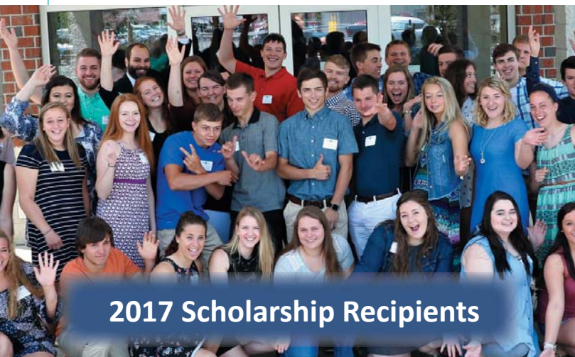
2017 Scholarship Recipients

Please visit www.cfnem.org to view the full 2017 CFNEM Annual Report where you'll find a complete list of funds, donors and grants for the year. And once you've read through Passion with a Purpose: A Community Foundation Storybook , please consider sharing the book with someone else; because stories are meant to be shared.