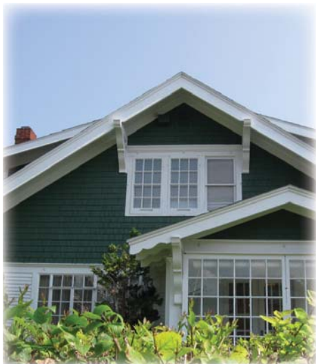
Presque Isle Historical Museum's Bradley House Updates