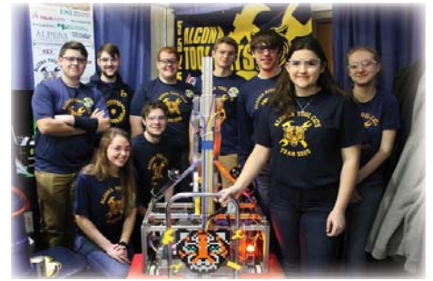
Alcona Community Schools’ Alcona Tool Cats Robotics Team

Music in Mackinaw Fund North Central Michigan College Northern Michigan Jail Ministry, Inc. Northern Michigan University SACF Administrative Fund School of Visual Arts Straits Area Audubon Society Straits Area Services, Inc. Thunder Bay Theatre University of Detroit Mercy University of Michigan Wolverine Community Library Wolverine Community Schools