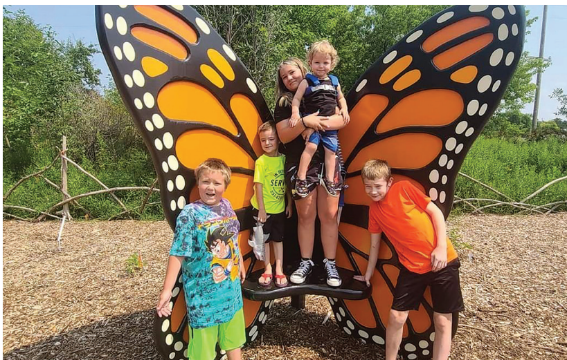
Top photo: Students receive haircuts and school supplies at Cheboygan Compassionate Ministries' back-to-school event; visitors enjoy the interactive butterfly exhibit on the Cheboygan Children's Trail.

granted from all Straits Area Community Foundation funds in fiscal year 2021 (10/1/2020 - 9/30/2021)