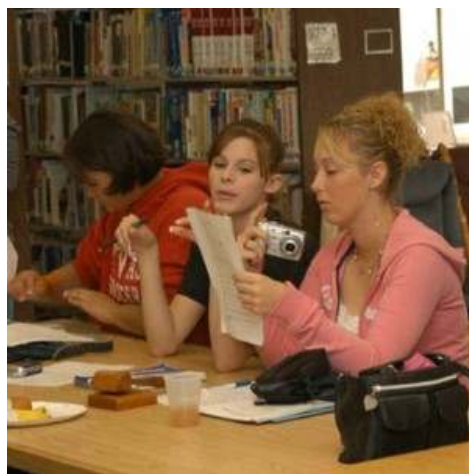
ICCF Whitewater YAC members review grant applications to award to youth programs in Iosco County.