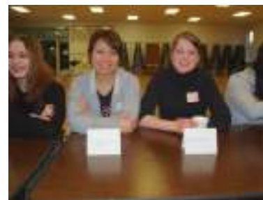
Foreign Exchange students serve in a panel discussion.

A fun-filled evening planned by youth, and experienced by youth is what it's all about at