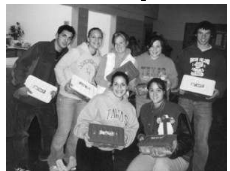
YAC members often lend a hand to community service projects in their communities.

ICCF YAC, with the assistance of an adult advisor, awards grants to youth-oriented programs in Iosco County using funds from the Iosco County Kellogg Youth Endowment Fund. Each year, the YAC is able to provide about $12,000 in grants to area programs. As the endowment grows, through interest and future gifts, the amount available to grant also grows.