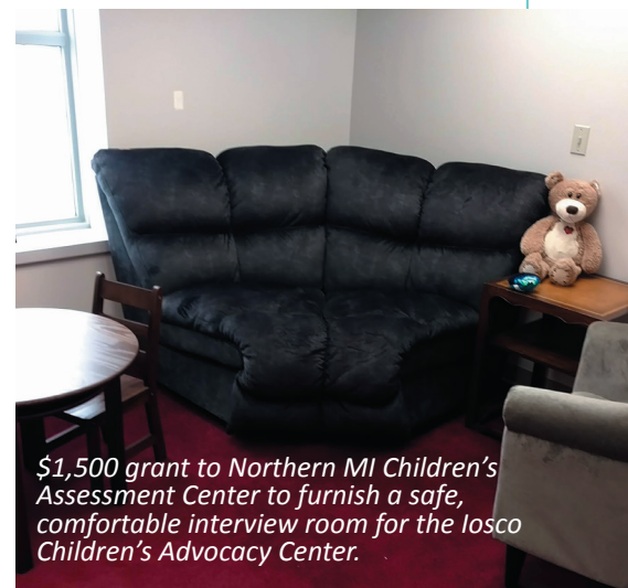
$1,500 grant to Northern MI Children's Assessment Center to furnish a safe, comfortable interview room for the Iosco Children's Advocacy Center.