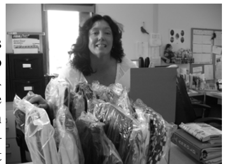
A volunteer at St. Paul Lutheran Church fills backpacks with school supplies to donate to local children before the start of the 2010 school year.

Among those grants included funding for Iosco County Coats for Kids. A $300 mini-grant helped the group purchase coats in infant and toddler sizes—something they had not been able to do before.