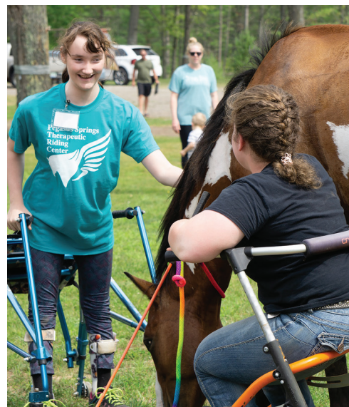
Pegasus Springs Therapeutic Riding Center's Summer Equine Therapy program