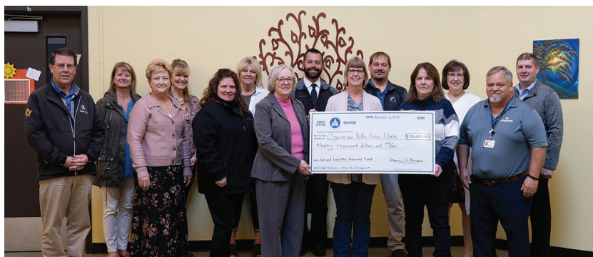
Clockwise from top right: NCMCF 2022 Financial Snapshot; Rayola, Inc. volunteers pack comfort care packages for foster children; Skidway Lake Kiwanis Club's "Breakfast with Santa" event; NCMCF representatives present a $30,000 grant to Ogemaw Hills Free Clinic from the Jim and Loretta Howard Fund.