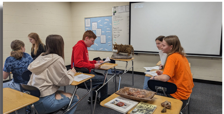
Members of the Straits Area Youth Advisory Council discuss grant recommendations to award grants from the Straits Area Kellogg Youth Fund.

The Straits Area Community Foundation makes every effort to recognize our donors properly. If we have unintentionally omitted or misspelled your name, please accept our sincerest apologies and advise us of corrections to be made.