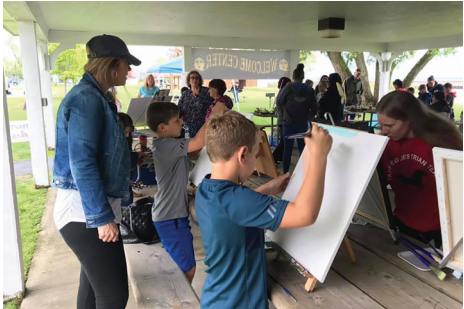
Above, the second annual Sunrise Solstice Art and Music Festival draws visitors, residents, families, kids and artists to Tawas Bay for a weekend of the arts. An ICCF Community Improvement grant provided funds to help the festival be a success.