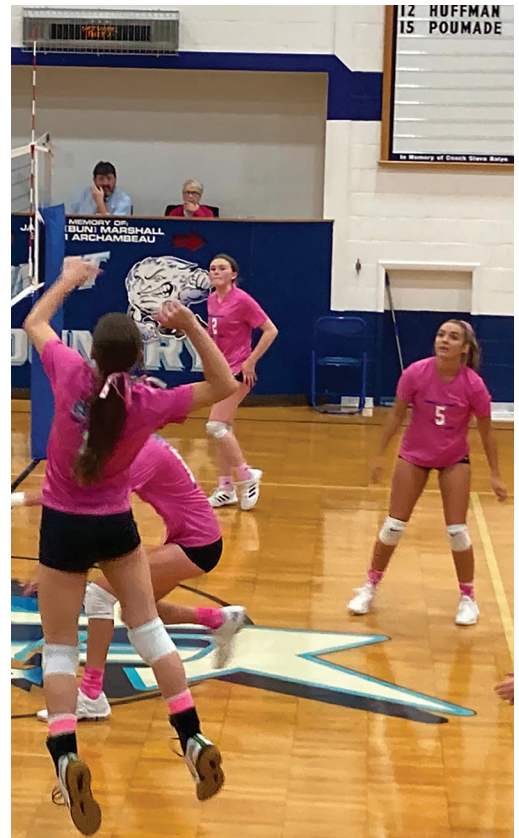
Top photo: Volunteers prepare basic necessities for Cheboygan County Project Connect. Bottom photo: Mackinaw City Public Schools "Pink Out" Annual Basketball Game

SACF is an affiliate of the Community Foundation for Northeast Michigan.