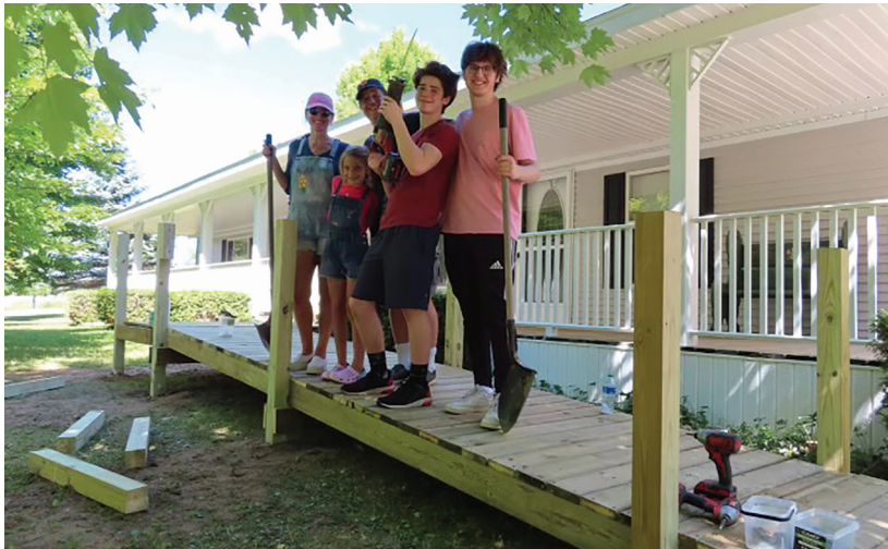
Above photos: Cheboygan County Habitat for Humanity volunteers helped install temporary ramps and work on critical home repairs for Cheboygan County residents in need. SACF Community Impact Grants supported these projects.