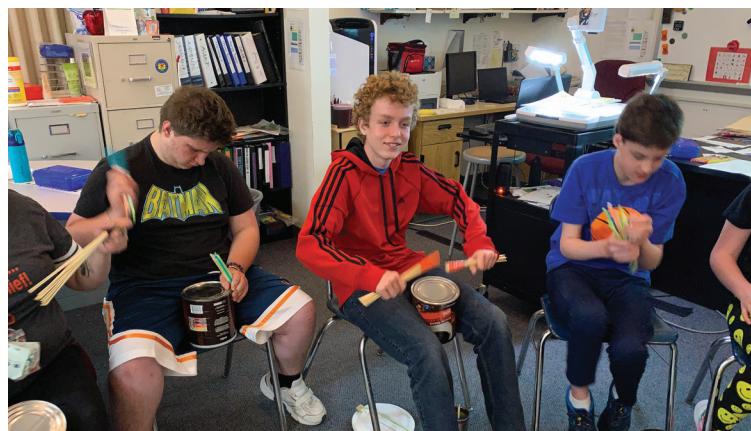
Students from Cheboygan Area Schools enjoy music in class as part of Cheboygan Area Arts Council's Children's Theatre Residency program.

The Straits Area Community Foundation makes every effort to recognize our donors properly. If we have unintentionally omitted or misspelled your name, please accept our sincerest apologies and advise us of corrections to be made.