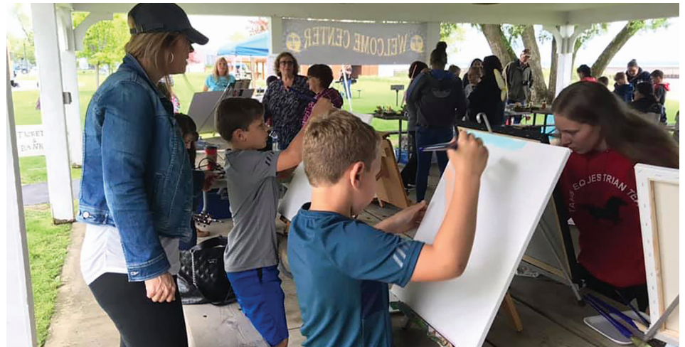
2019 Sunrise Solstice Art and Music Festival

Tawas Area Middle School - Scholarships for Educational Projects $1,200