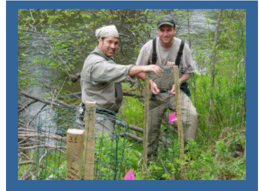
Volunteers mark tree-planting sights along the South Branch of the AuSable River.

A grant for over $700 was given from this fund to the Huron Pines RC&D to plant more cedar trees along this section of the AuSable River – a project that will encourage species diversity and sustain healthy ecosystems. They will also provide shade to cool the waters and grow roots that will stabilize the riverbanks to prevent erosion, among many other benefits.