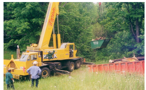
Volunteer workers watch as a crane lifts years' worth of debris from the Bruski Sinkhole into a large dumpster.

The grant will specifically provide funding to purchase one 40-yard dumpster to aid in the removal of debris from the sinkhole, as well as providing lunch for the 12-20 volunteers who will be spending a full day working in the hole and on its perimeter.