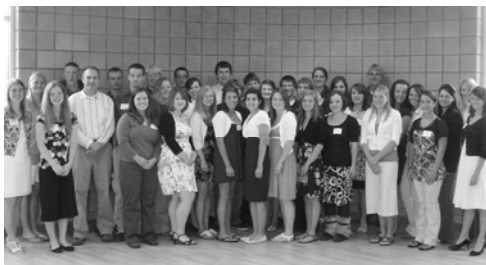
Many 2010 CFNEM Scholarship Recipients attended an awards ceremony in June and had the chance to meet with the ones who made

For many CFNEM donors who establish funds at the Community Foundation, the importance they place on college education is often a driving factor. Because these donors chose to give back to their community this way, CFNEM was able to award nearly $380,000 in scholarships to students from its nine-county service area.