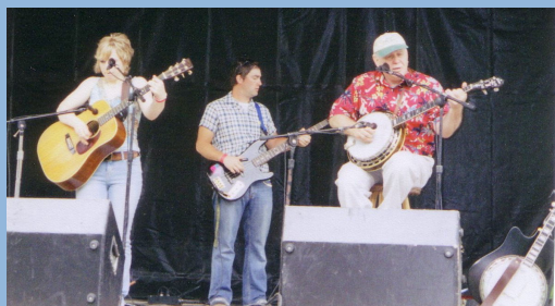
The Banjo Pickers play on the main stage at the AuSable Valley Nor-east'r Festival.

The AuSable Valley Nor-east'r Association of Folk held their 2005 Music and Art Festival over the summer – an event funded in