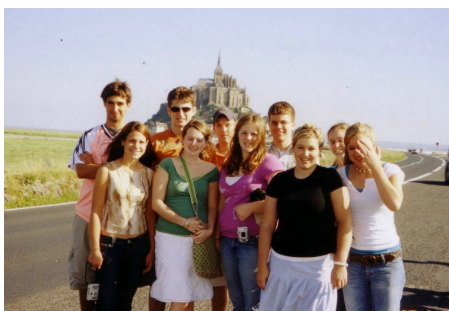
Students from the Inland Lake French Club visited Mont-Saint-Michel at Normandy during their trip to France.

France was the destination for students from Inland Lakes High School French Club. The group spent a few days in Paris, the Loire Valley, and the Atlantic Coast. The $1,000 grant was used to purchase passport photos and pay the passport fees for the students.